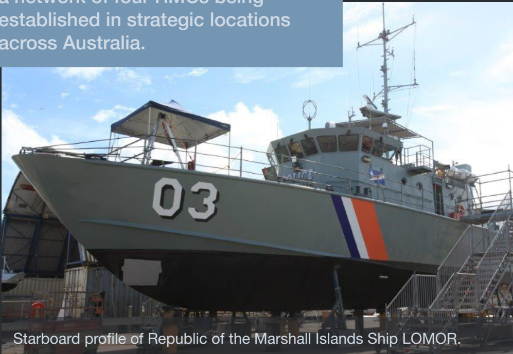
Starboard profile of Republic of the Marshall Islands Ship LOMOR.

RMC North East is the first in a network of four RMCs being established in strategic locations across Australia.